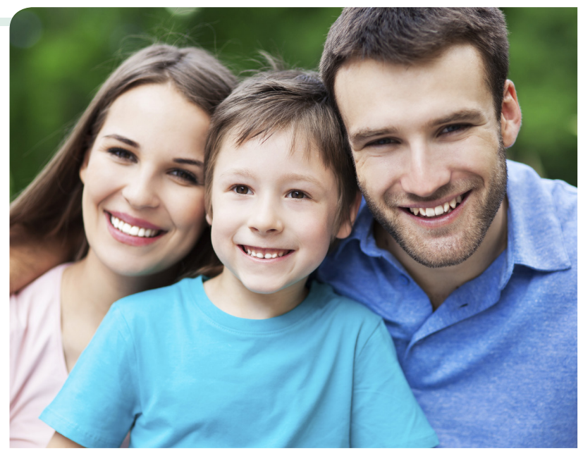
Help your young child with ADHD with behavior therapy.